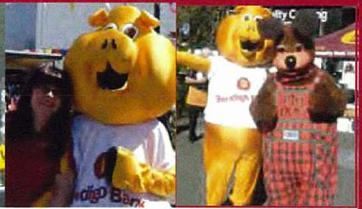
LISAROW BIRTHDAY BBQ APRIL 2010