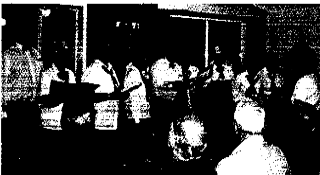
▲ Keppel Bay Community Choir.